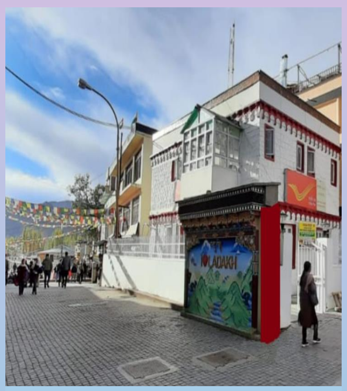
Wall Art at Leh City Post Office, J&K

Rs.1.51 crore revenue earned from sale of scrap