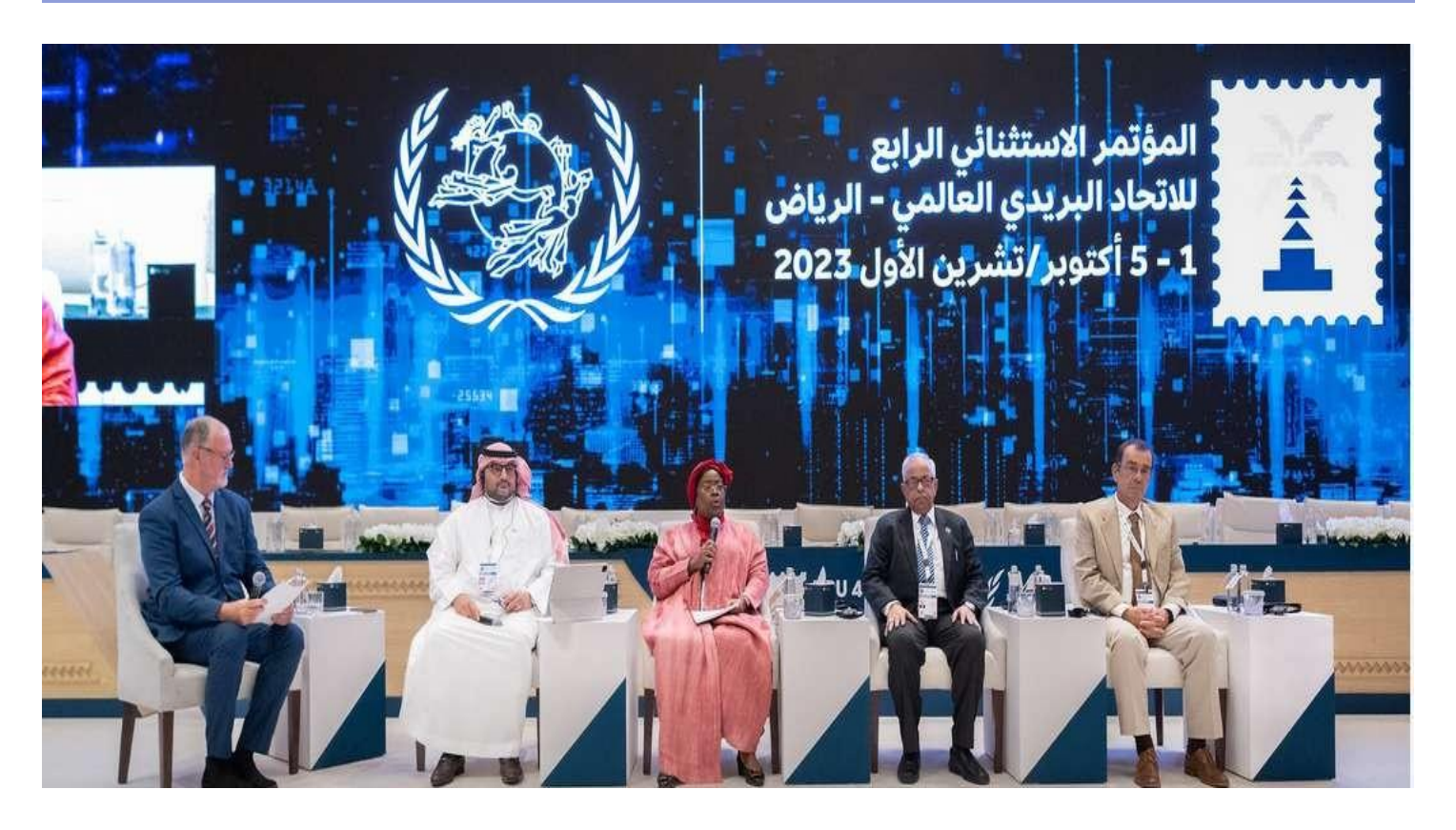
Secretary (Posts) led the Indian delegation to Riyadh, for the 4th Extraordinary Congress of UPU from 1<sup>st</sup> to 5<sup>th</sup> October, 2023.