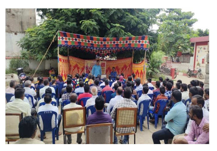
Dak Chaupal Event at Guntur, Andhra Pradesh

Department has taken the initiative of "Dak Chaupal" (Dak Community Development Program). Dak Chaupals go beyond traditional outreach efforts by providing on-spot services, offering citizens immediate access to essential Government services. These services include Aadhaar updation and enrolment, enrolling individuals as beneficiaries in Government Schemes such as PM Kisan Samman Nidhi etc. Further, the initiative facilitates the linking of Aadhaar with Ayushman Bharat Cards, opening of Sukanya Samriddhi Accounts, etc. Dak Chaupals not only serve as platforms for service delivery but also as an opportunity to impart financial literacy by empowering individuals with knowledge about the available financial instruments and products.