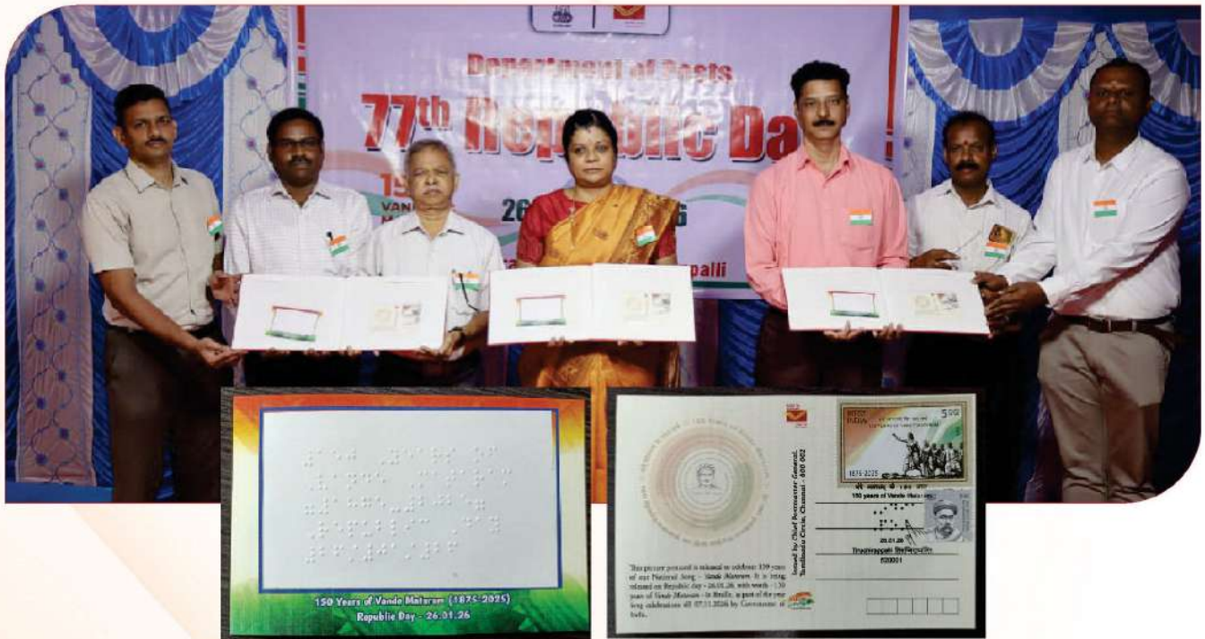
As part of the 150 years of Vande Mataram celebration and the 77 th Republic Day of India, Central Region, Tiruchirappalli, Tamil Nadu Circle released a limited edition Thematic picture postcard featuring Braille inscriptions.