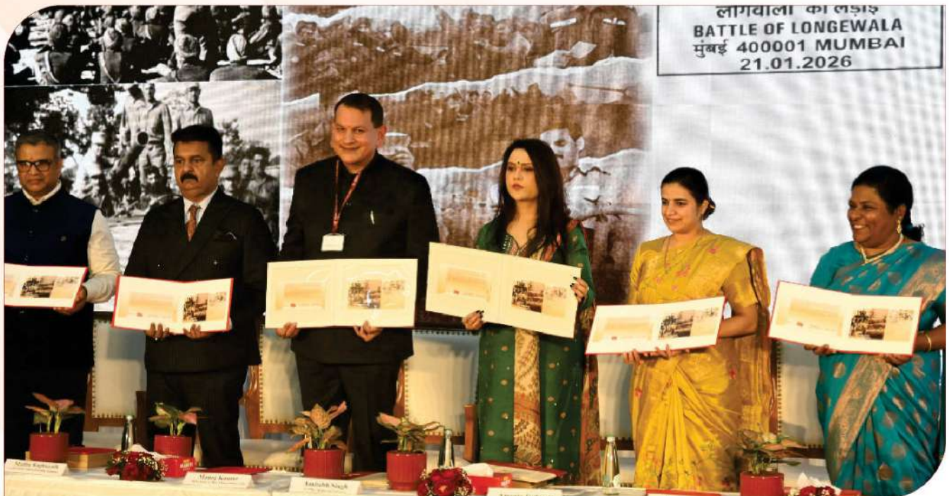
India Post released a Special Postal Cover at Mumbai GPO commemorating the historic Battle of Longewala (1971), a defining moment of the 1971 India-Pakistan War that symbolises exceptional courage and strategic brilliance. The cover honours the valour of the 23 rd Punjab Regiment and the decisive role of the Indian Air Force's 122 Squadron, whose coordinated defence and air support repelled a major enemy offensive.