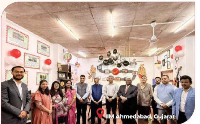
IIM Ahmedabad, Gujarat