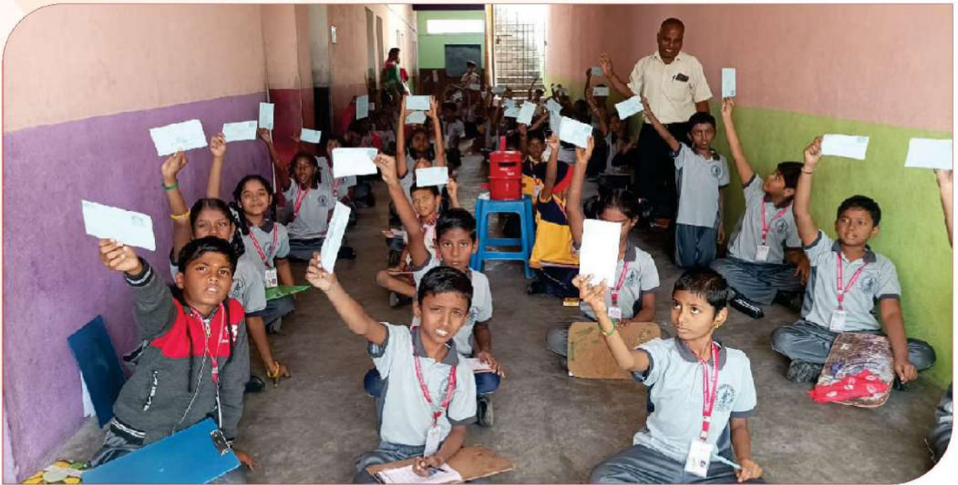
The Dhai Akhar Letter Writing Competition held at Dayalan Primary and Nursery School, Walajapet, Tamil Nadu Circle witnessed enthusiastic participation from young students, promoting handwritten communication and nurturing creativity at an early age.