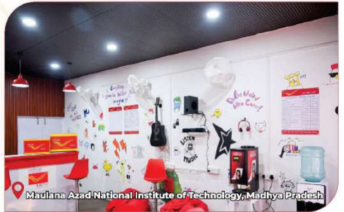
Maulana Azad National Institute of Technology, Madhya Pradesh