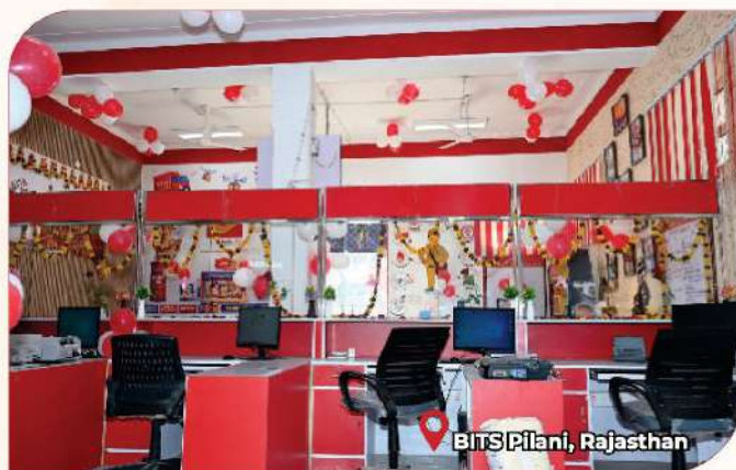
BITS Pilani, Rajasthan