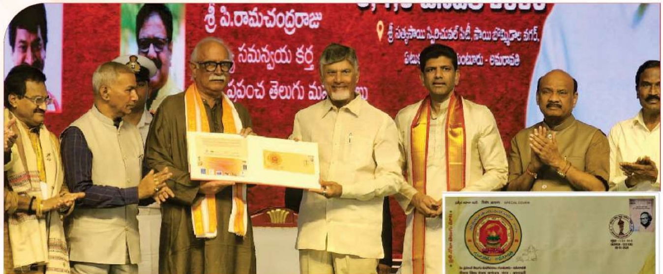
A Special Cover was released at the 3 rd World Telugu Conference - 2026 in Guntur, Amaravati, Andhra Pradesh Circle, celebrating the richness of Telugu language, literature and cultural heritage. The release took place in the gracious presence of Hon'ble Minister of State for Communications, Dr. Chandra Sekhar Pemmasani and Hon'ble Chief Minister of Andhra Pradesh Shri. Nara Chandrababu Naidu