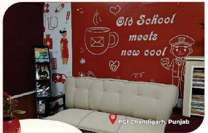
PCI Chandigarh, Punjab