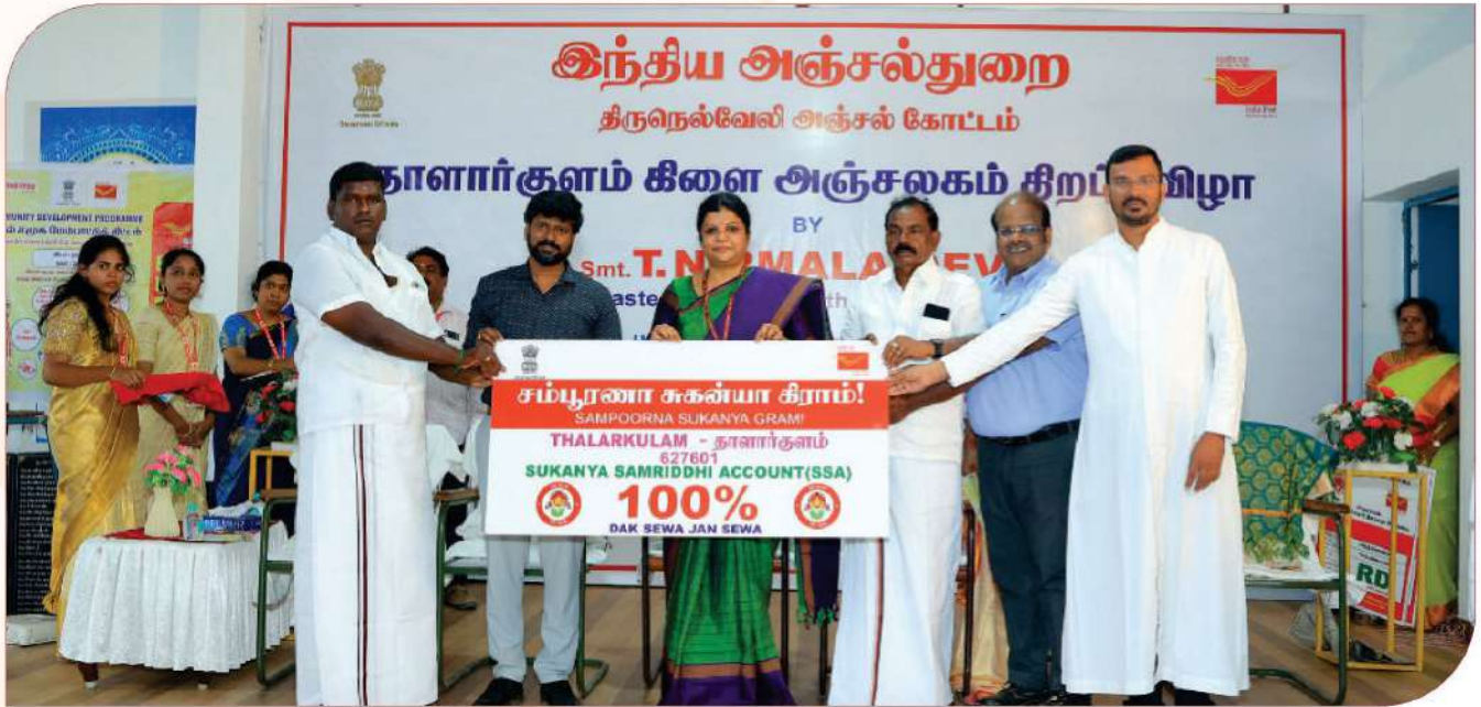
With the active participation of villagers, Thalarkulam was declared a Sampoorna Bima Gram and Sampoorna Sukanya Gram, reflecting collective trust and cooperation in achieving complete insurance and savings coverage.