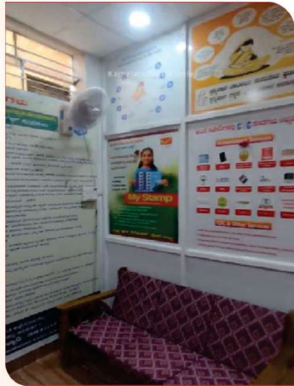
As a welfare initiative to promote comfort and dignity at the workplace, the Superintendent of Post Office, Bellary, inaugurated a Feeding Room, reinforcing the Department's commitment to employee well-being.