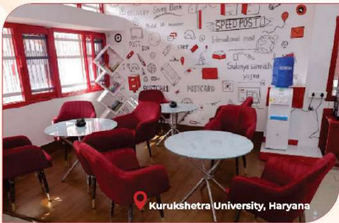
Kurukshetra University, Haryana