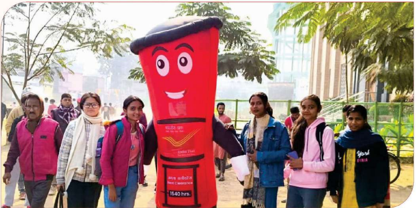
Through a Dak Chaupal organised at Marhaura, Bihar, India Post reached out to local communities to spread awareness about postal services, savings schemes, insurance products and digital facilities. The initiative enabled direct dialogue with citizens, including opening accounts for children under public welfare schemes.