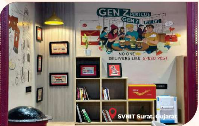
SVNIT Surat, Gujarat