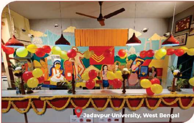
Jadavpur University, West Bengal