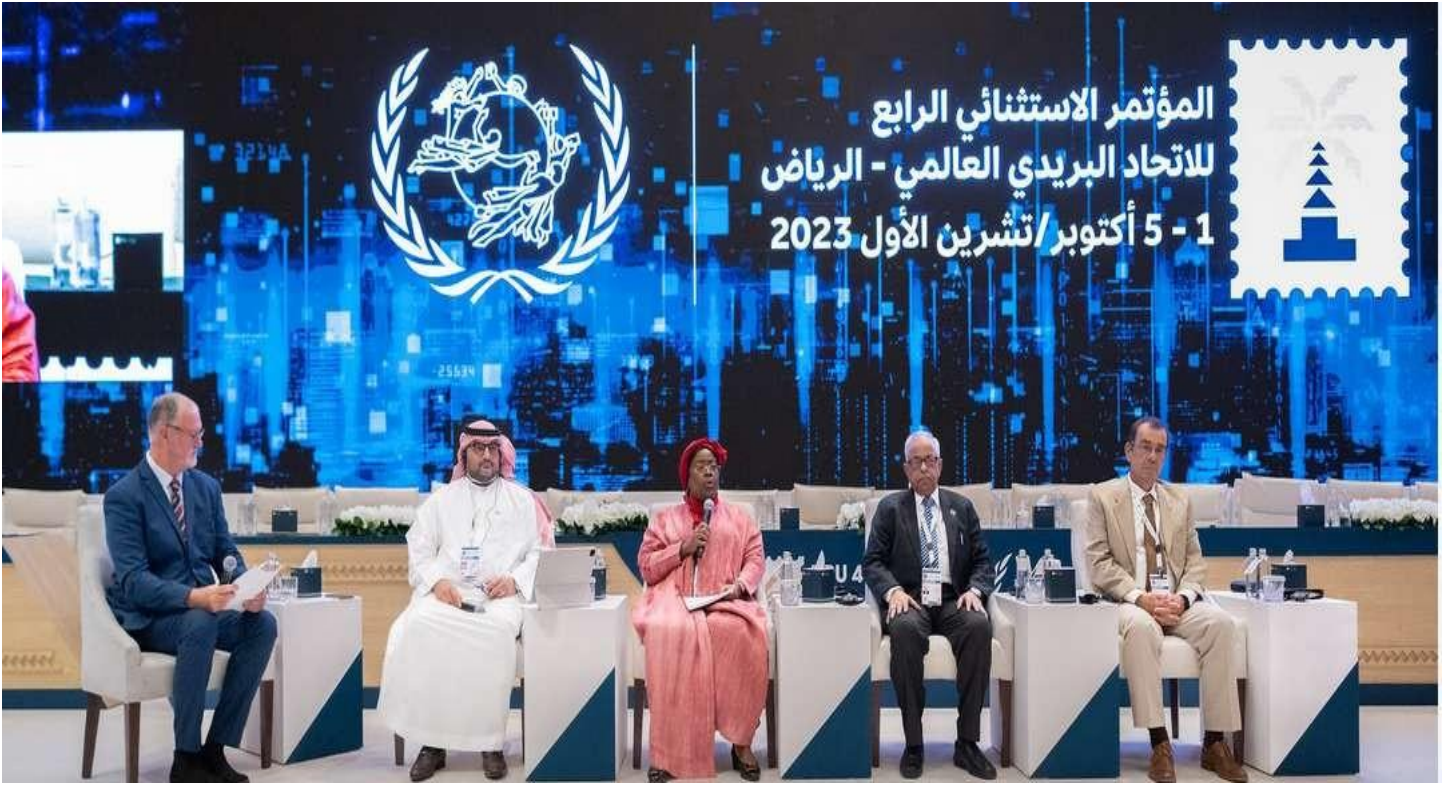
Secretary (Posts) led the Indian delegation to Riyadh, for the 4th Extraordinary Congress of UPU from 1 st to 5 th October, 2023.