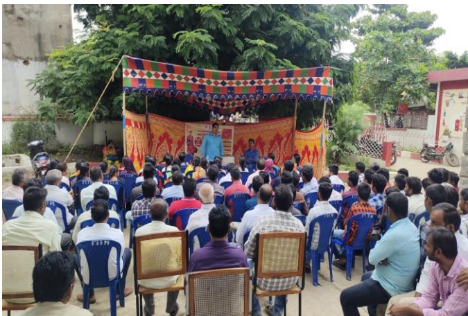
Dak Chaupal Event at Guntur, Andhra Pradesh

Department has taken the initiative of “Dak Chaupal” (Dak Community Development Program). Dak Chaupals go beyond traditional outreach efforts by providing on-spot services, offering citizens immediate access to essential Government services. These services include Aadhaar updation and enrolment, enrolling individuals as beneficiaries in Government Schemes such as PM Kisan Samman Nidhi etc. Further, the initiative facilitates the linking of Aadhaar with Ayushman Bharat Cards, opening of Sukanya Samridhi Accounts, etc. Dak Chaupals not only serve as platforms for service delivery but also as an opportunity to impart financial literacy by empowering individuals with knowledge about the available financial instruments and products.