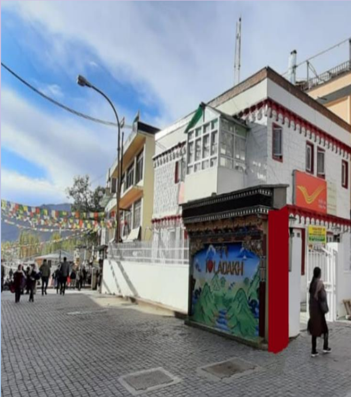
Wall Art at Leh City Post Office, J&K

Rs.1.51 crore revenue earned from sale of scrap