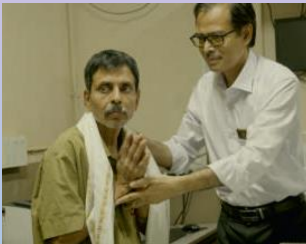
Felicitation of 'Safai Mitra' at Kolkata GPO

Under Special Campaign 3.0, Department of Posts revived around 1600 Sq. ft. space that was being used for storing condemned unserviceable items, by setting up Vishrantika - The Staff Lounge . This unique facility with games, magazines and comfortable seating to help staff relax and rejuvenate, was inaugurated on 31 st October, 2023 in the presence of Secretary (DARPG). Vishrantika is also being used for small get together and events.