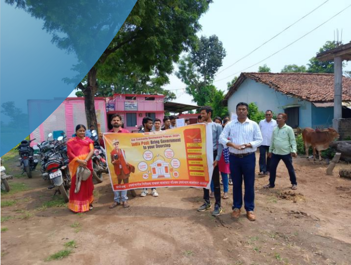
Pre-event promotional activity through rally at Balaghat Division – Madhya Pradesh